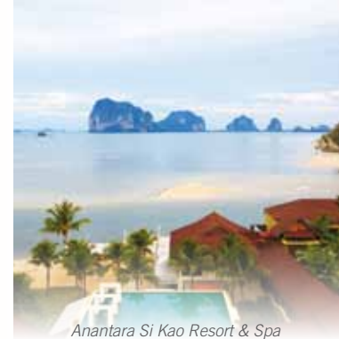
Anantara Si Kao Resort & Spa

Conditions: Hotel: Offer applicable to only Royal Orchid Plus members and cannot be used in conjunction with other promotions. Not applicable on public holidays, long weekends, festive seasons, and peak periods. Not applicable to group reservations and reservations for meetings, incentive, conventions and exhibition. Centara Hotels & Resorts reserves the right to cancel or amend bookings if terms and conditions are not followed. Dining: Offer is exclusively for Royal Orchid Plus members and it cannot be used in conjunction with any other promotional programs. Offer is not applicable to set/special discount menu unless specified otherwise. Offer is not applicable on public holidays and festive seasons. Advance reservation is required and subject to room space availability via Reservation Centre. Spa: *Offer applicable at Centara Chaan Talay Resort & Villas Trat. Offer applicable to only Royal Orchid Plus members and cannot be used in conjunction with other promotions. Offer applicable on a la carte treatment only and excluding Pedicure, Manicure or Waxing Services. Offer is valid for reservation from 10:00 hrs - 16:00 hrs daily. Advance reservation is required and subject to availability. Prices are based on published rates and subject to service charge and government tax.